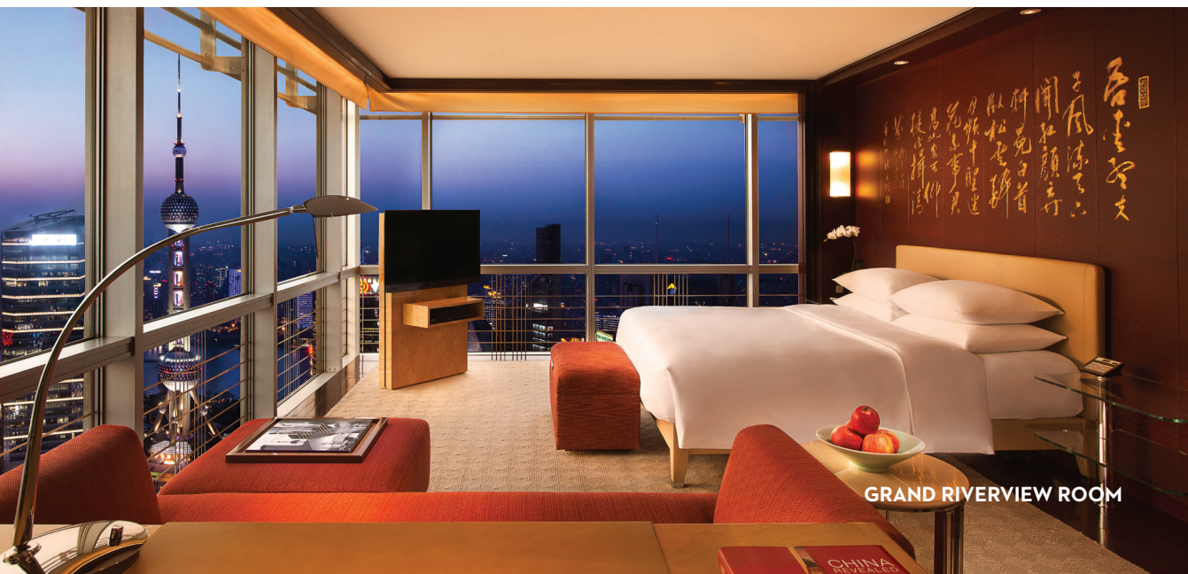
GRAND RIVERVIEW ROOM