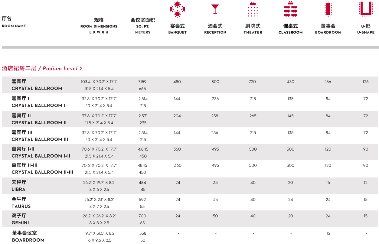
酒店裙房二层 / Podium Level 2